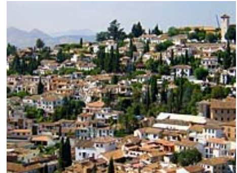
View of The Albayzin – the old Arabic quarter of Granada.

Here you can walk cobblestone streets, experience a thousand years of history, and yet be close to the vibrant centre of Granada – the best of two worlds.